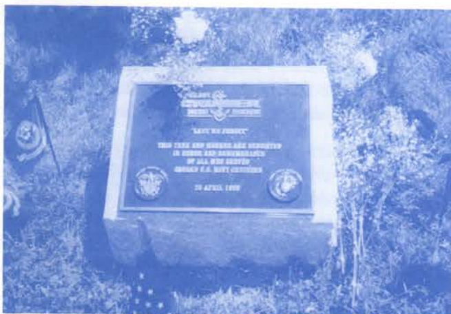
Memorial to Cruiser Sailors at Arlington National Cemetery